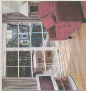
An apartment at Trenython Manor, above; Cornwall's rugged coastline, left

For more details, tel: 01764 661075 or visit www.clccountryhomes.com .